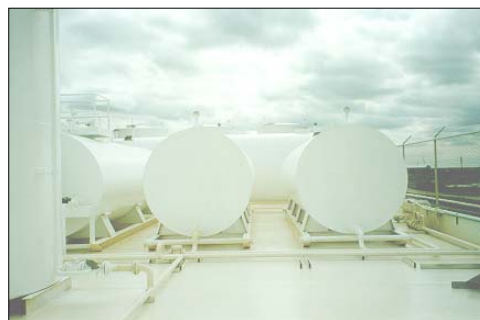
Figure 7-3. Shop-built containers elevated on saddles.

Scenario 4: Shop-built containers placed on a liner. For certain shop-built containers with a shell capacity of 30,000 gallons or under, visual inspection, plus certain additional actions to ensure the containment and detection of leaks, is also considered by EPA to provide equivalent environmental protection. Actions may include placing the containers onto a barrier between the container and the ground, designed and operated in a way that ensures that any leaks are immediately detected. For example, placing a shop-built container on an adequately designed, maintained, and inspected synthetic liner would generally provide equivalent environmental protection. Determination of environmental equivalence is subject to good engineering practice, including consideration of industry standards, as certified by the PE in accordance with §112.3(d).