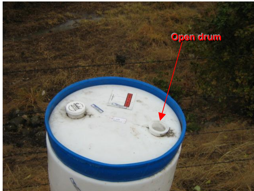
Photograph 3. District 2 Red Bluff Slab Project – Open drum of detergent along the highway storm water conveyance system. (Note: Drum appeared empty, possibly due to the missing bung)