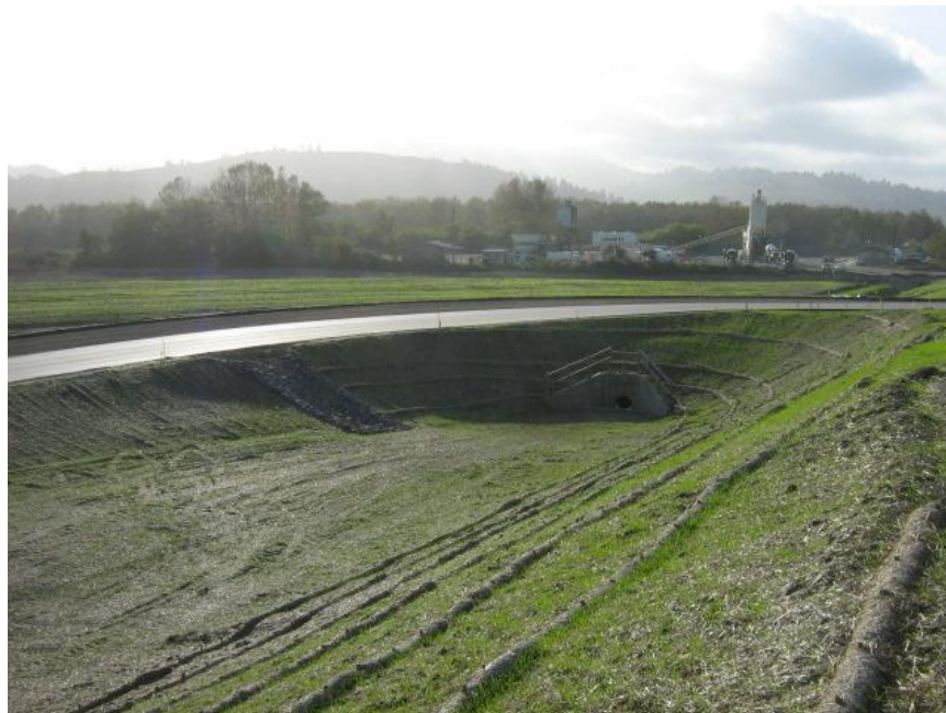
Photograph 2. Alton Interchange Project – Combination of multiple erosion and sediment controls