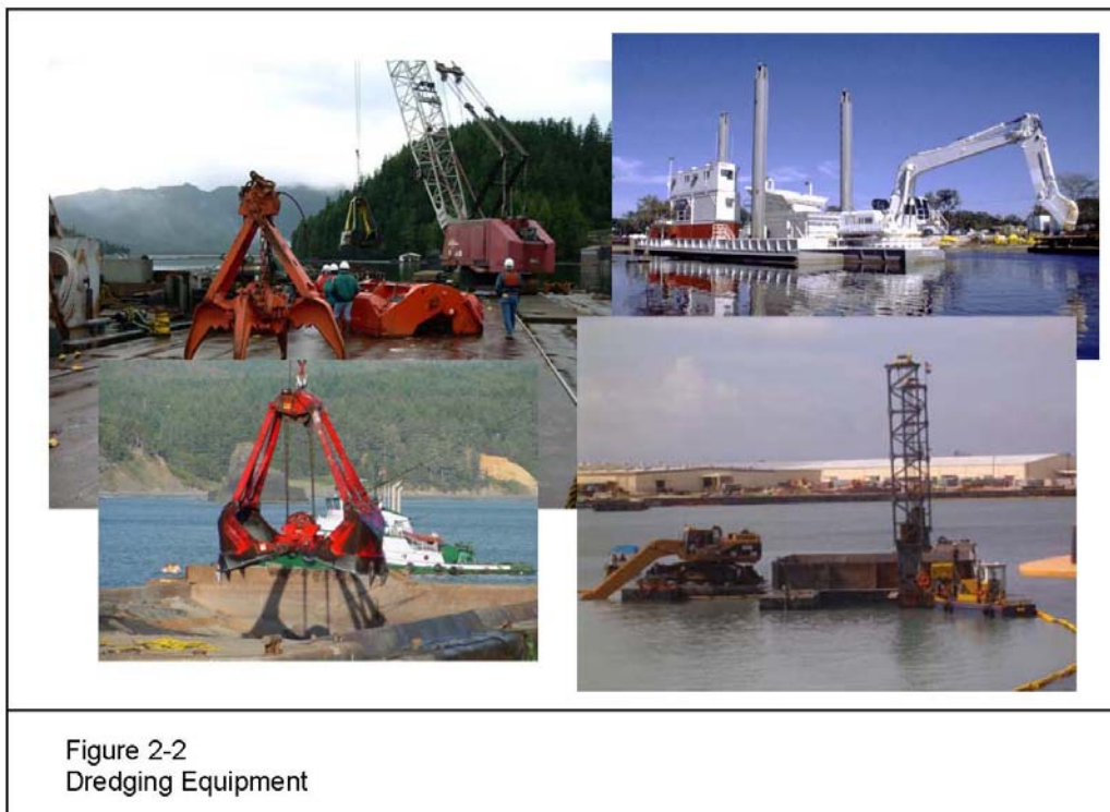
Figure 2-2 Dredging Equipment

The size of the dredge bucket and scows, and number of scows available factor into the maximum transport distance. The most efficient mechanical dredging operations use at least two scows so that the dredge can continue to work filling one scow while the other is being towed to and from the ODMDS. The ZSF analysis indicated that for the clamshell dredging options using two scows, the economically feasible transit distance for maintenance projects is up to 18 nm (33 km) from the entrance to Apra Harbor.