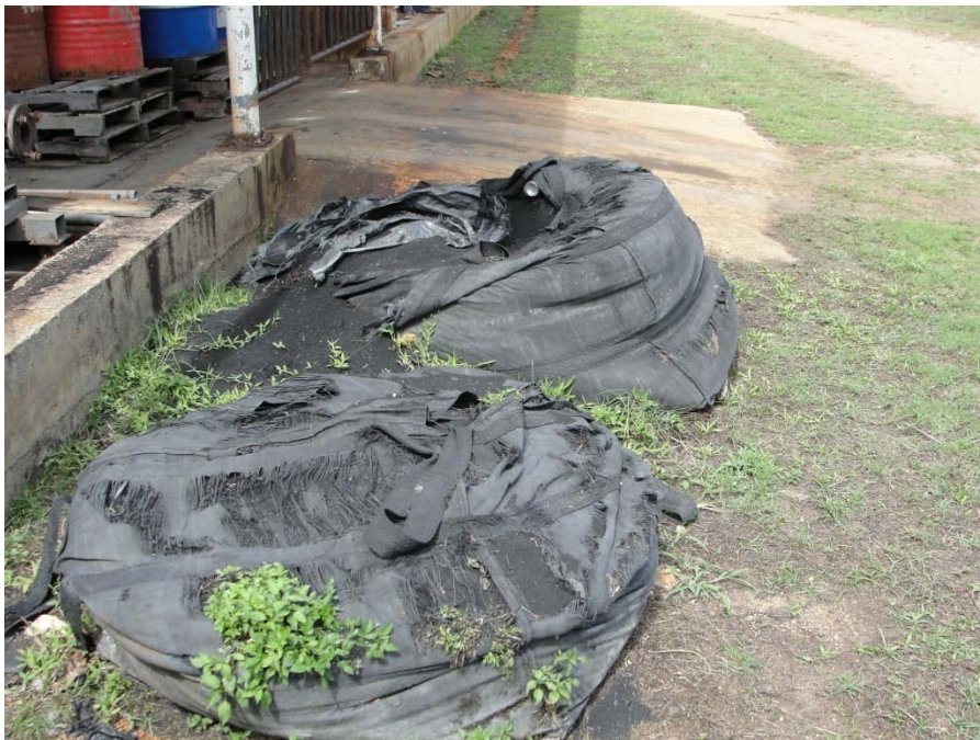
Photo 12: Spilled sandblasting grit was observed on the ground during the inspection.