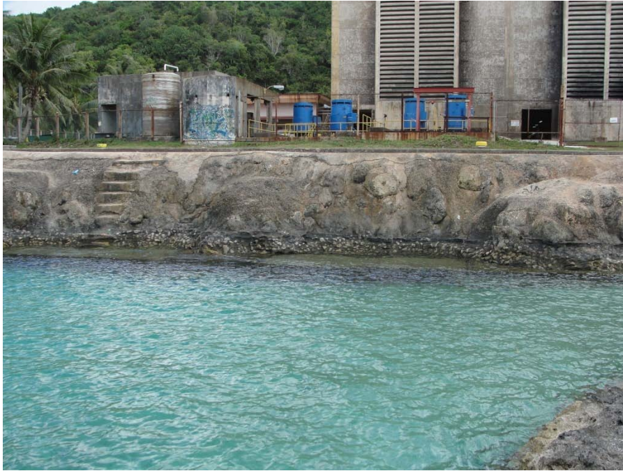
Photo 3: Intake structure, located below water level. Note blue intake pumps in the background.