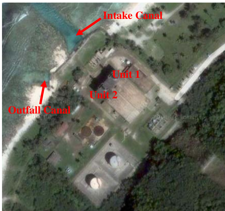
Photo 2: Overview of the Tanguisson Power Plant from Google Maps, with intake canal, outfall canal, and Units 1 and 2 identified.