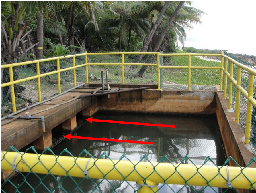
Photo 10: Low volume waste final pH adjustment basin. Effluent flows through the openings on the left, down a channel, and is then discharged out through Outfall Serial No. 001A.