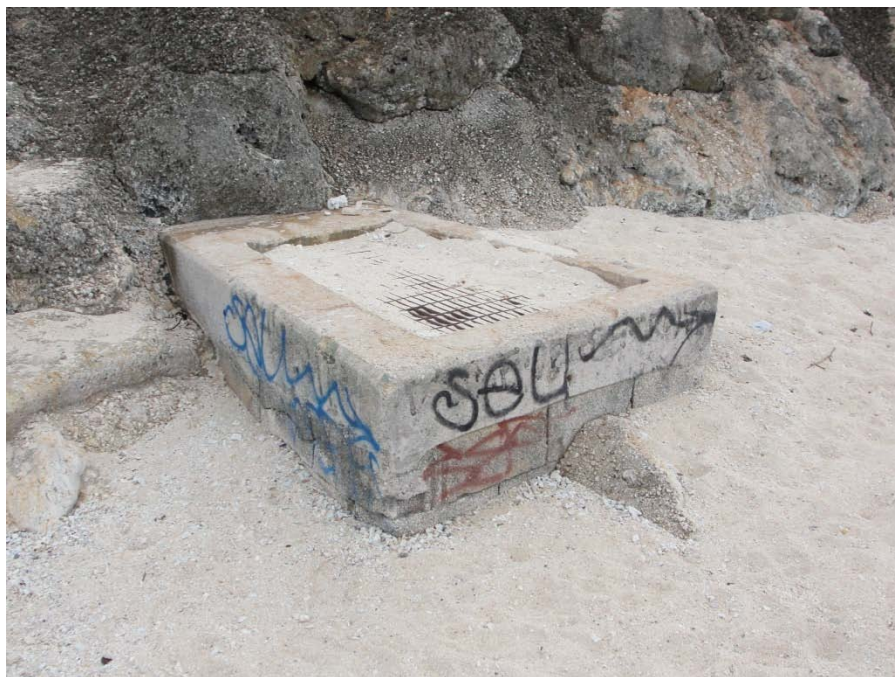
Photo 8: Outfall Serial No. 001B. Note that the outfall is clogged with sand and is not being utilized.