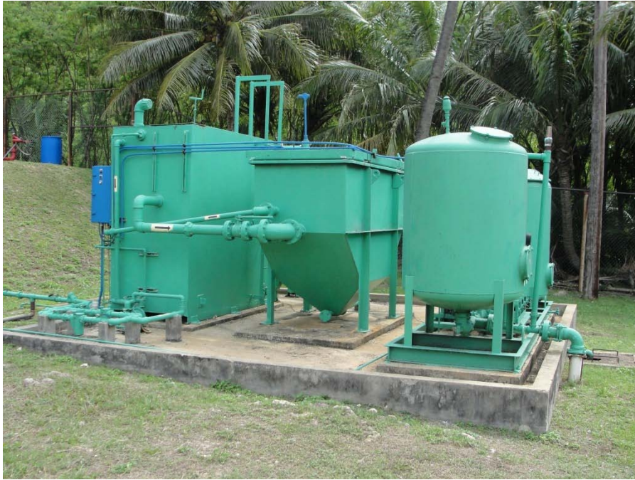
Photo 13: On-site ground water remediation project. Unrelated to NPDES Permit No. GU0000027.