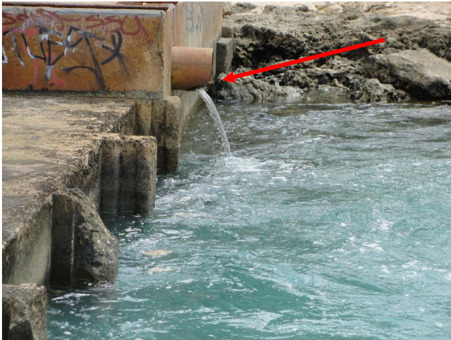
Photo 6: Outfall Serial No. 001A, located adjacent to Outfall Serial No. 001.