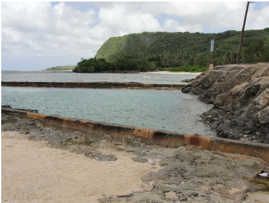
Photo 4: Intake canal, leading to intake structure, which is located below water level.