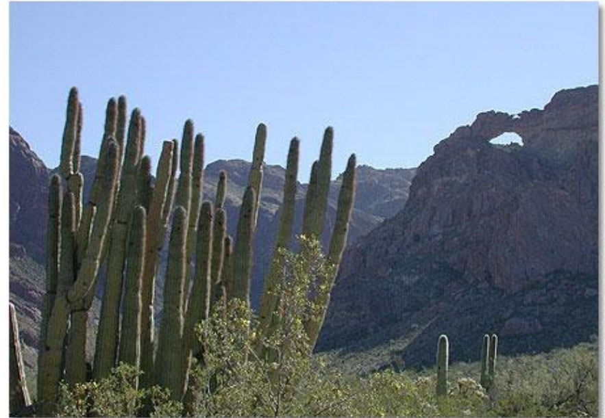
Organ Pipe Cactus