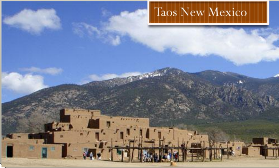
Taos New Mexico