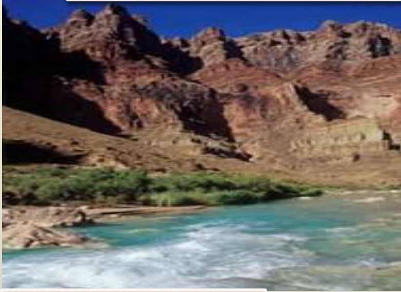
Little Colorado River