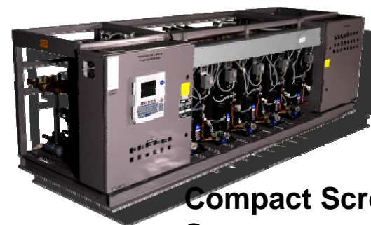
Compact Scroll System