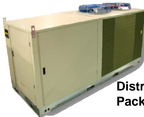
Distributed Scroll Pack