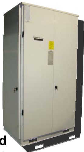
Distributed Scroll System