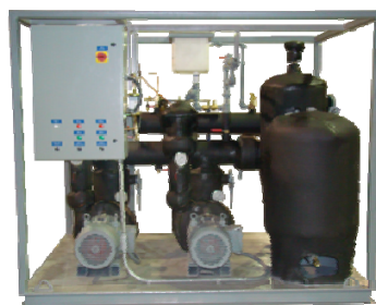
Glycol Pumping Station