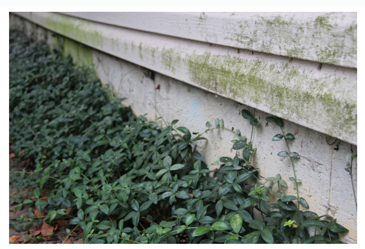
Take out plants like this and replace them with gravel or stones.

Even outdoor sanitation is important. Plants that hug the foundation will attract and protect pests, such as mice and rats.