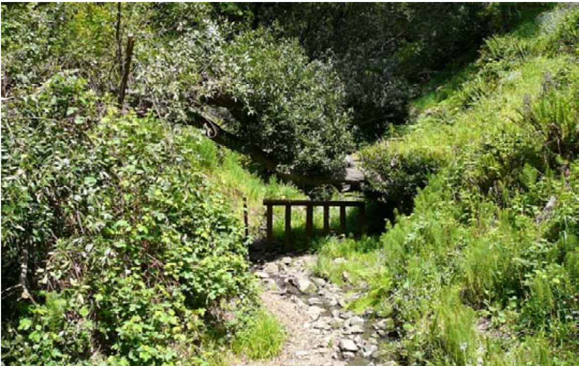
Oakland Photo 12: 2108 Mastlands SSO site.