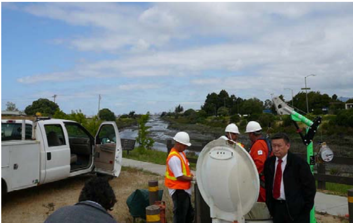
Oakland Photo 2: Hegenberger PS