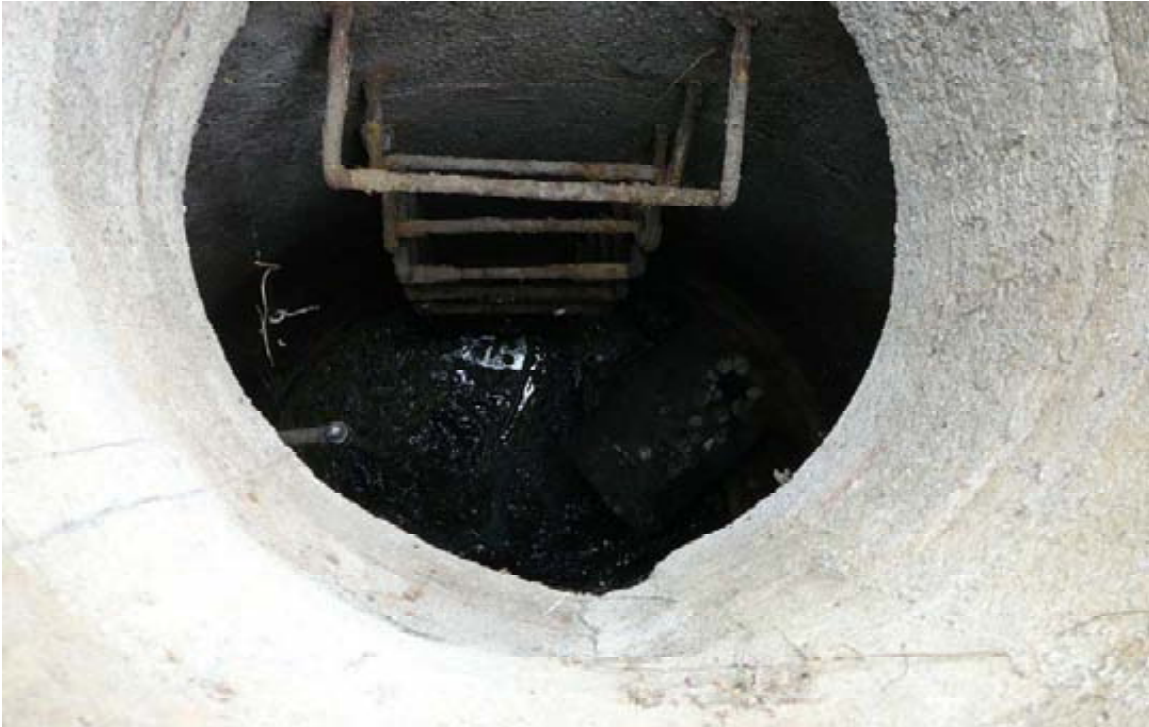
Oakland Photo 3: Hegenberger PS wet well