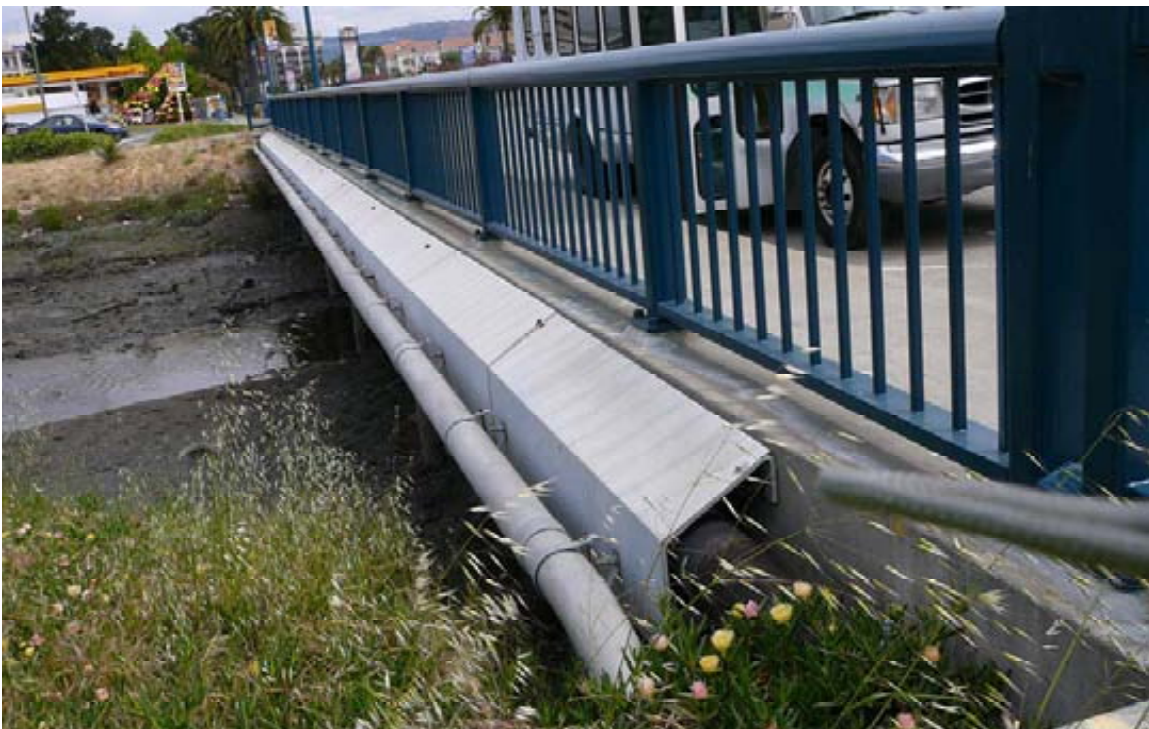
Oakland Photo 4: Hegenberger PS force main at bridge