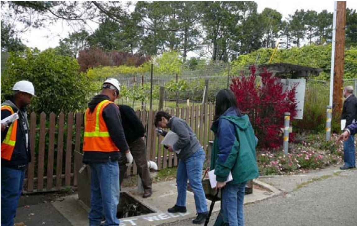
Oakland Photo 10: Denton Place PS.