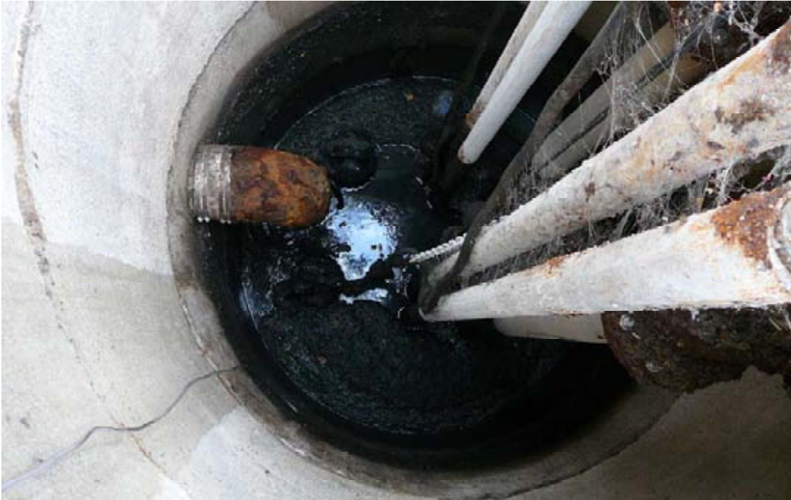
Oakland Photo 9: Denton Place PS wet well.