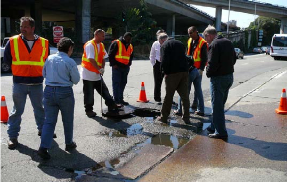
Oakland Photo 15: Santa Clara and Oakland Avenue event.