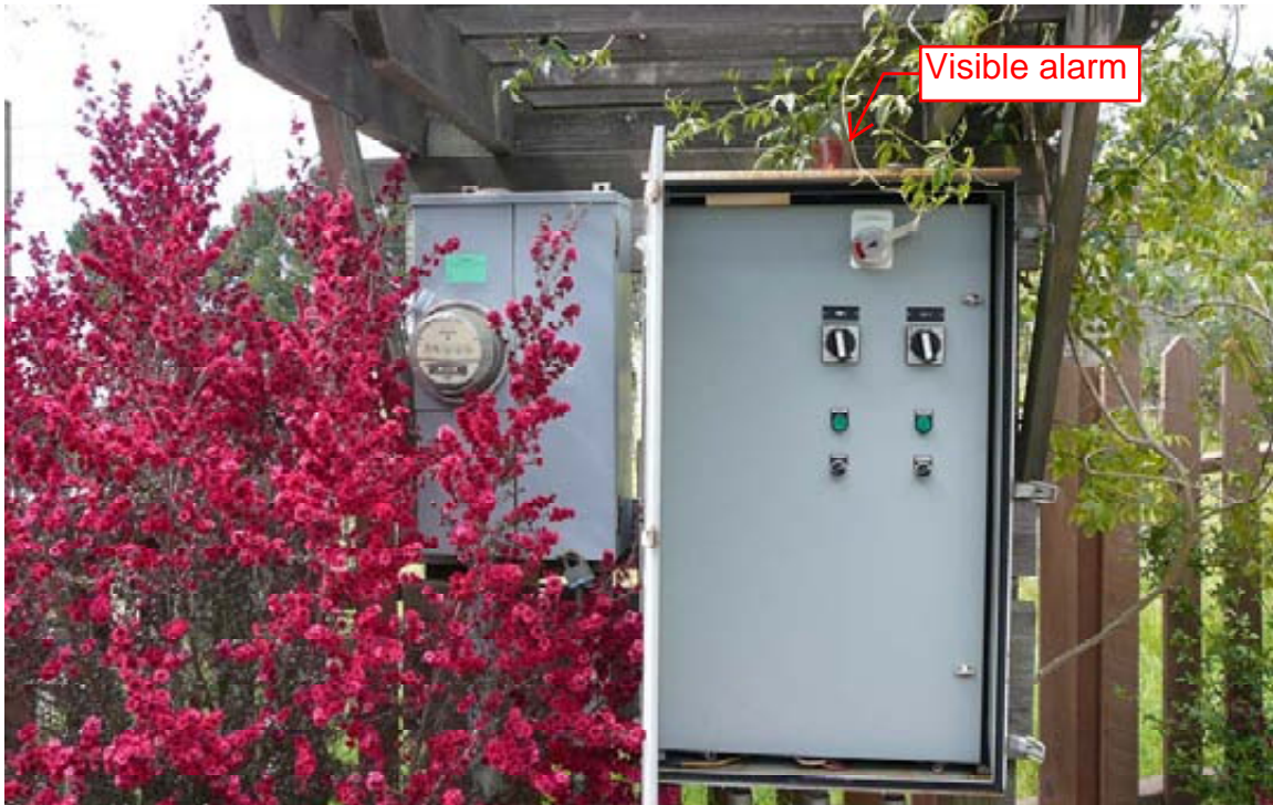
Oakland Photo 11: Denton Place PS pump controls and visible alarm.