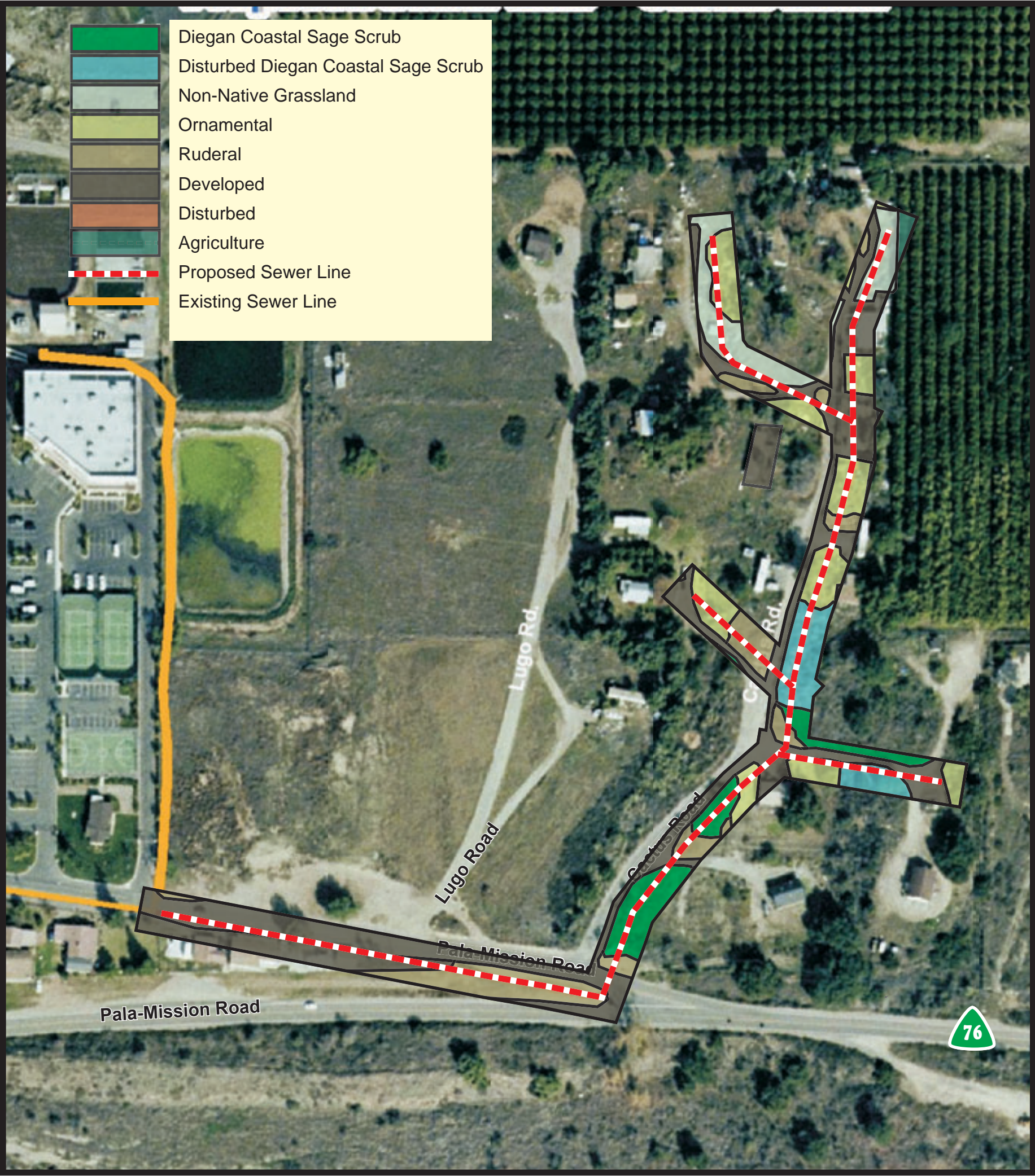
FIGURE 4b Biological Resources Map Cactus Road Area (Area 4)