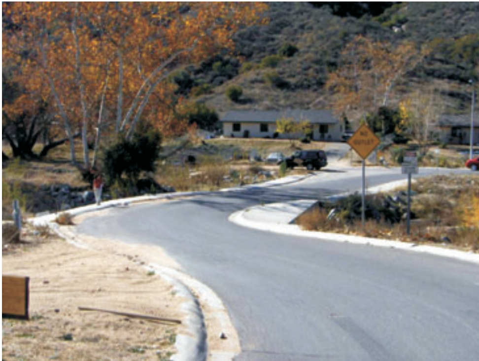
View of Sycamore Road crossing of Pala Creek, looking west (12/22/05)