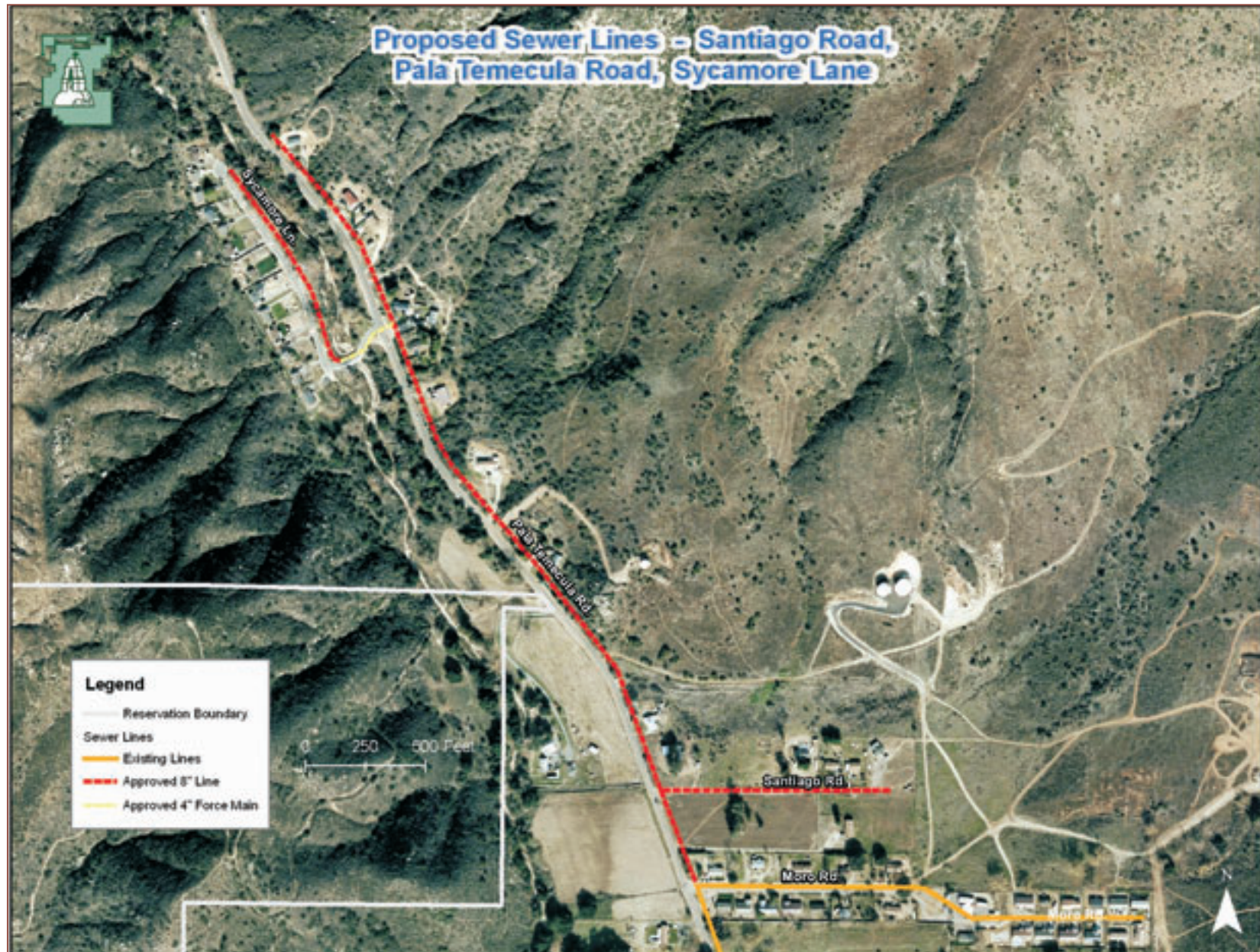
Figure 3a Proposed Sewer Lines Pala Temecula Road Area (Area 1)