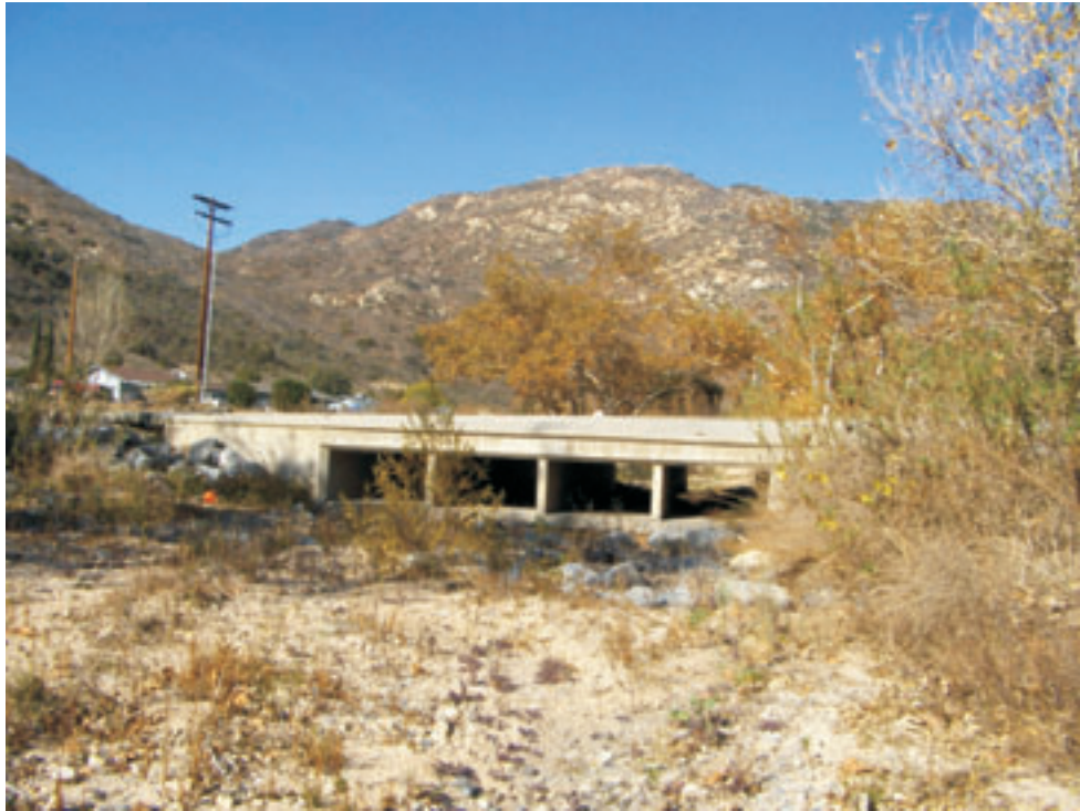
View of Sycamore Lane crossing of Pala Creek, looking north (12/22/05)