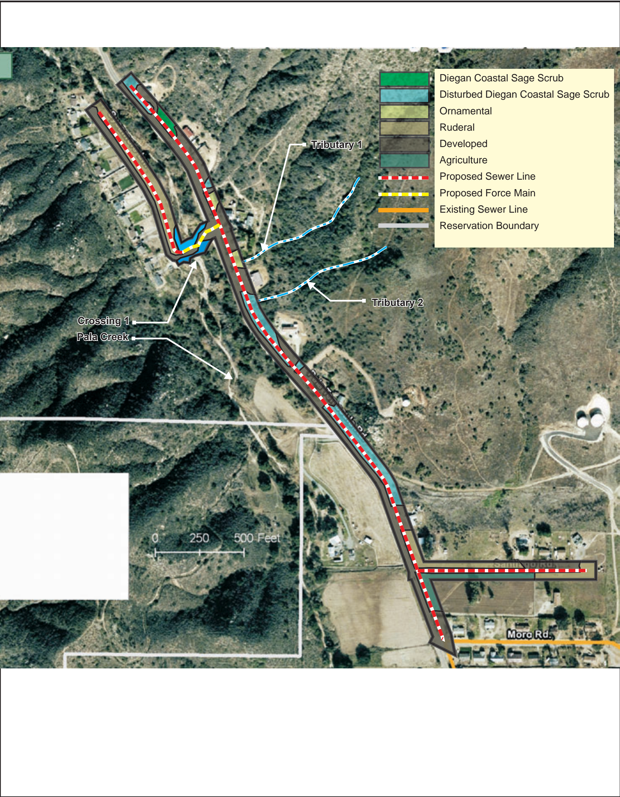
FIGURE 4a Biological Resources Map Pala-Temecula Road (Area 1)