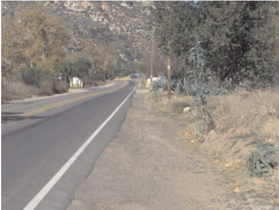
View of Pala Temecula Road south of Sycamore Lane, looking north (12/22/05)