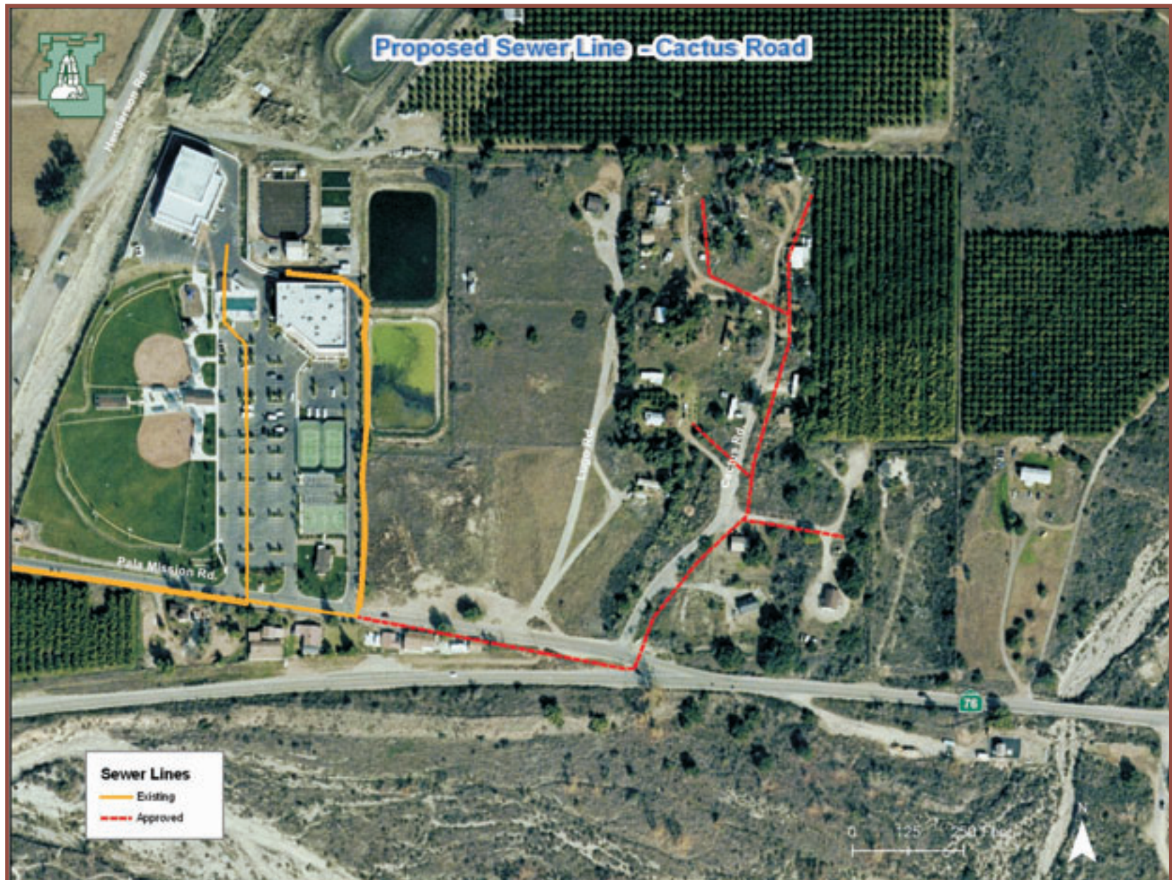
Figure 3b Proposed Sewer Lines Cactus Road Area (Area 4)