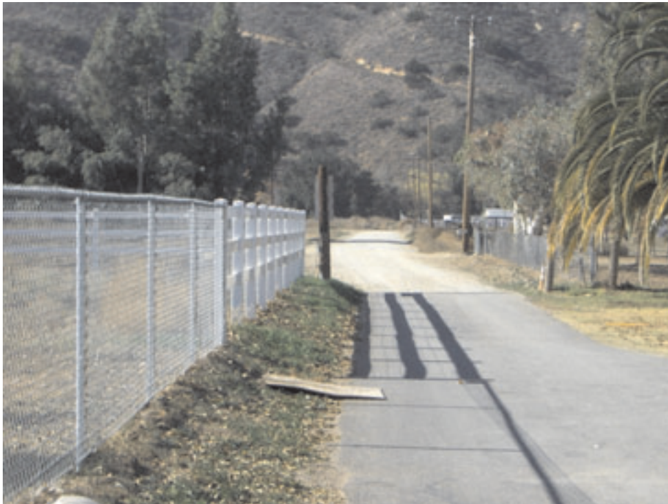
View of Santiago Road, looking west (12/22/05)