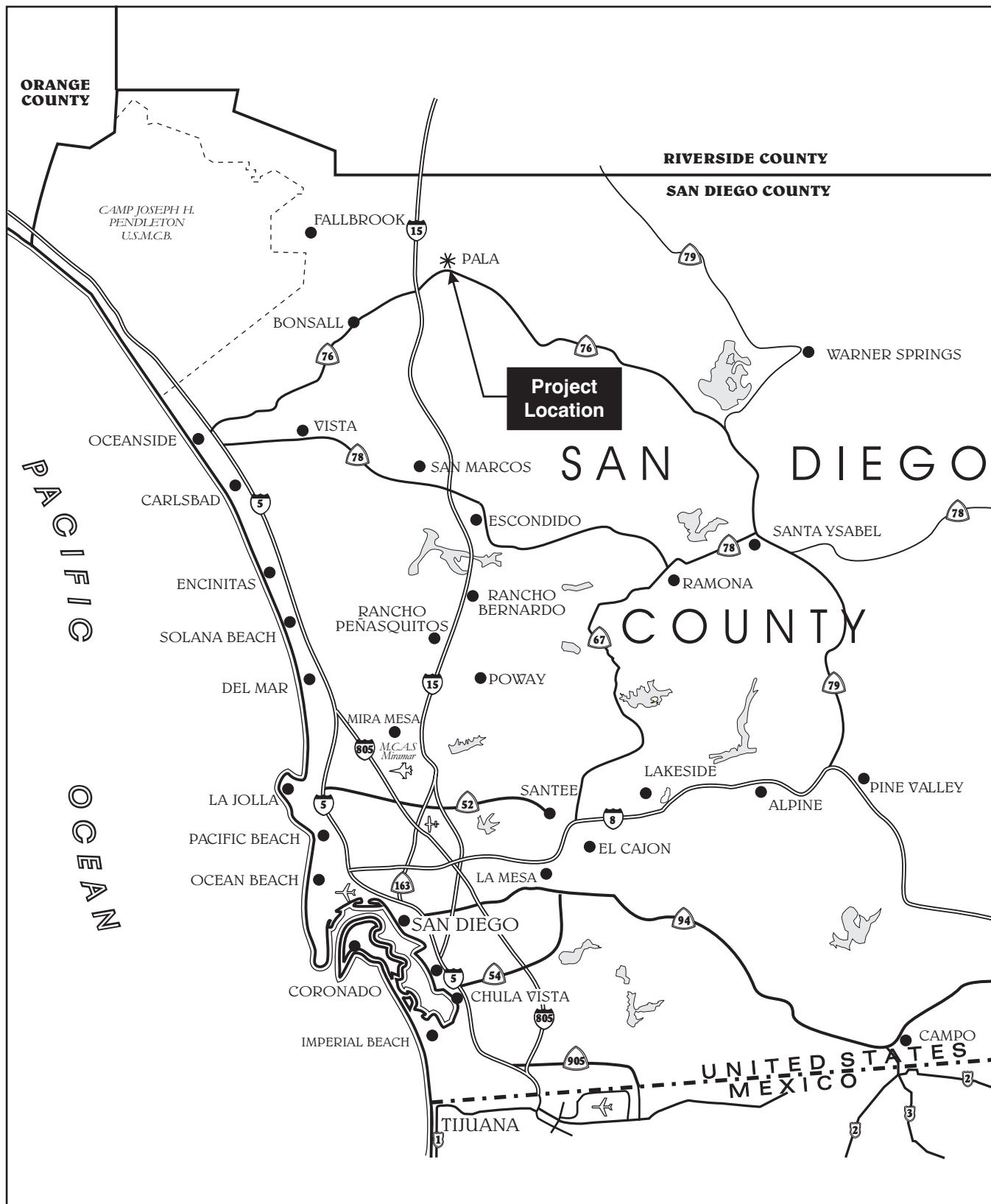
Figure 1 Regional Location Map