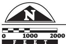
Figure 2 Project Location Map

SOURCE: USGS 7.5' Quad Maps - Pala and Pechanga