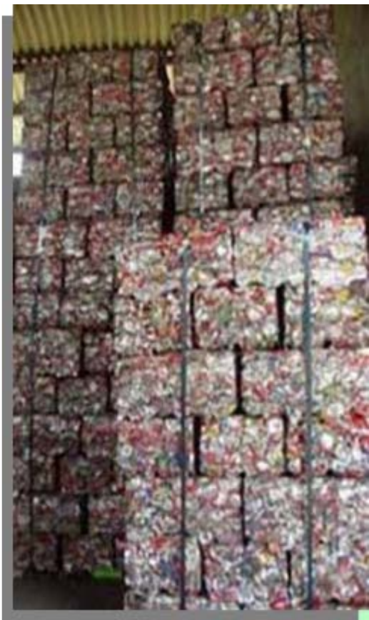
Baled aluminum cans.