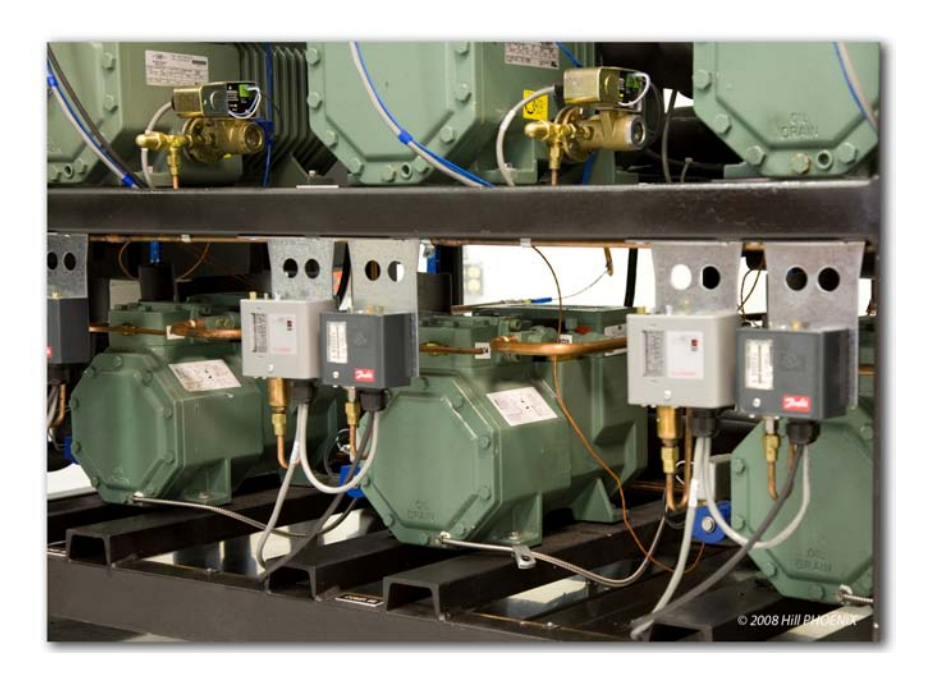
CO<sub>2</sub> Compressors on the SNLTX<sub>2</sub> Cascade System

But Price Chopper was looking for further innovations in its efforts to reduce energy consumption. In fact, says Martin, Price Chopper specified several innovations including "high-efficiency ECM fan motors and LED lighting in all cases, the use of reach-in door cases for all new medium-temperature loads, and variable-speed fan control for the air-cooled condensers. That quest for innovation is what ultimately led them to use our next generation SNLTX<sub>2</sub> low temperature refrigeration system."