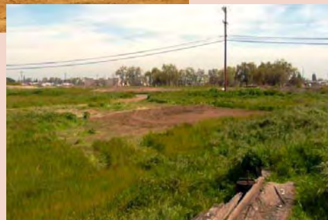
Removing contaminated soil from site (above) Site ready for Civic Center and Park redevelopment (below)