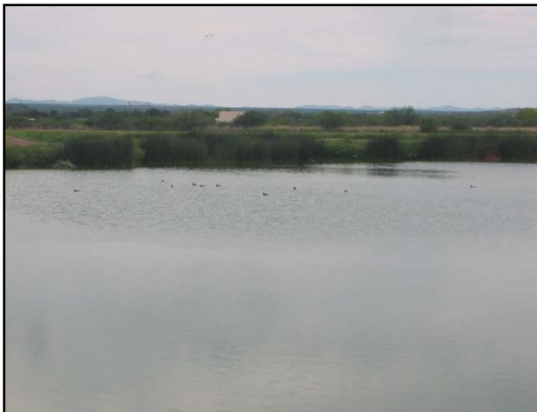
Photograph 1. Existing holding pond