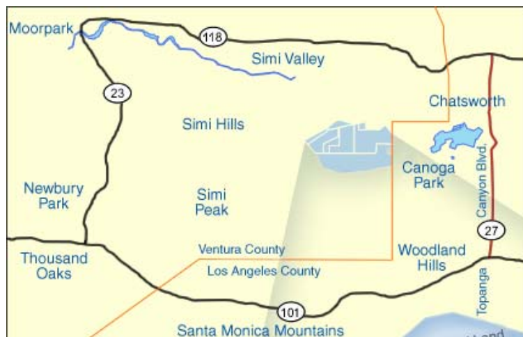
Figure 1: Santa Susana Field Laboratory Site

The results of the PA/SI investigation are available to the public in the three existing SSFL repositories at the Simi Valley Library, California State University, Northridge, and the Los Angeles Public Library (see library contact information at the end of this fact sheet). They are also posted on the EPA Region IX webpage ( http://www.epa.gov/region09/waste/sfund/santasusana/index.html ).