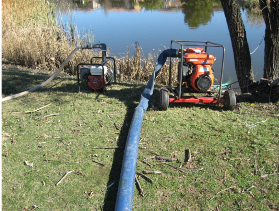
Photograph 13: Actively operating pumps used to drain the golf course pond

Inspected by: Scott Coulson (PG Environmental, LLC)