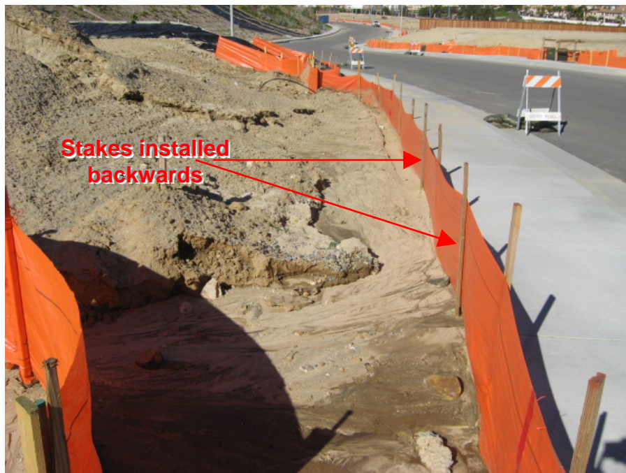
Photograph 8: The silt fence was not installed on the contour and stakes were incorrectly positioned on the up-gradient side of the silt fence