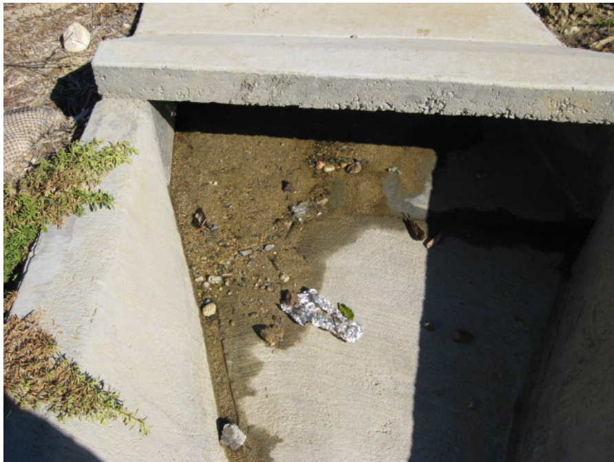
Photograph 10: Sediment accumulated in the drainage conveyance located down-gradient of Photographs 8 and 9