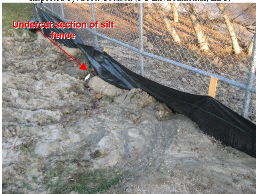
Photograph 3: A section of silt fence at the base of the slope had been undercut by a previous flow event

Inspected by: Scott Coulson (PG Environmental, LLC)