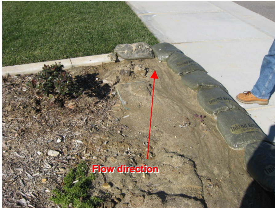
Photograph 9: Sediment accumulated in the down-gradient landscaping

Inspected by: Scott Coulson (PG Environmental, LLC)