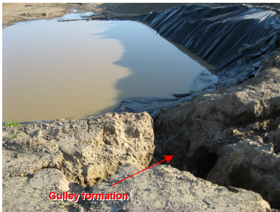
Photograph 5: Sediment laden water in the structural control and gulley erosion present at the inlet area