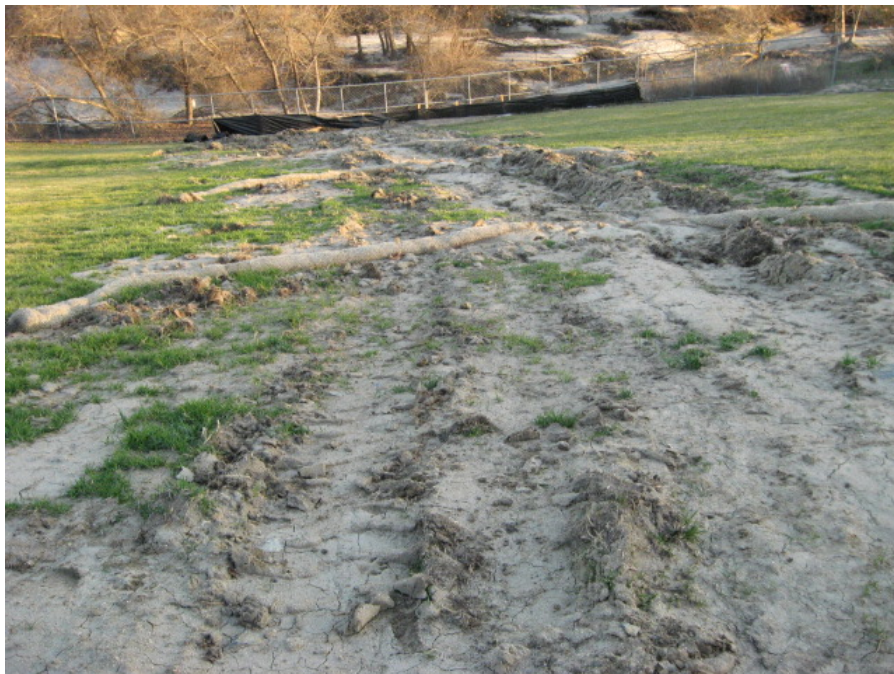
Photograph 1: View of the disturbed slope area at the northern perimeter of the YMCA site