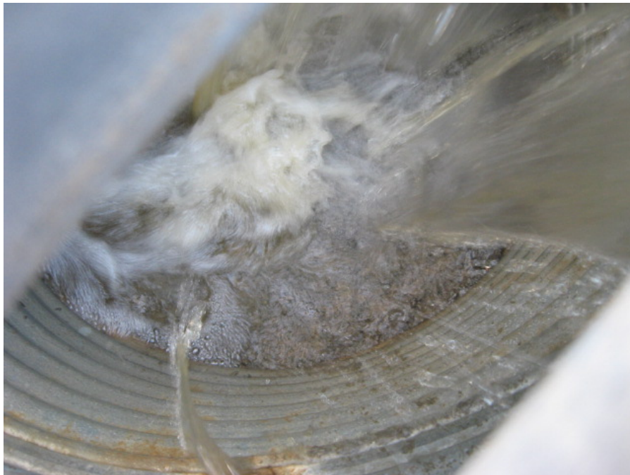
Photograph 16: View inside storm drain inlet leading to the Pechanga Parkway Drainage Channel