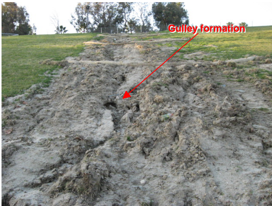
Photograph 2: Slope erosion was observed, including rill and gulley formation at the base of the slope