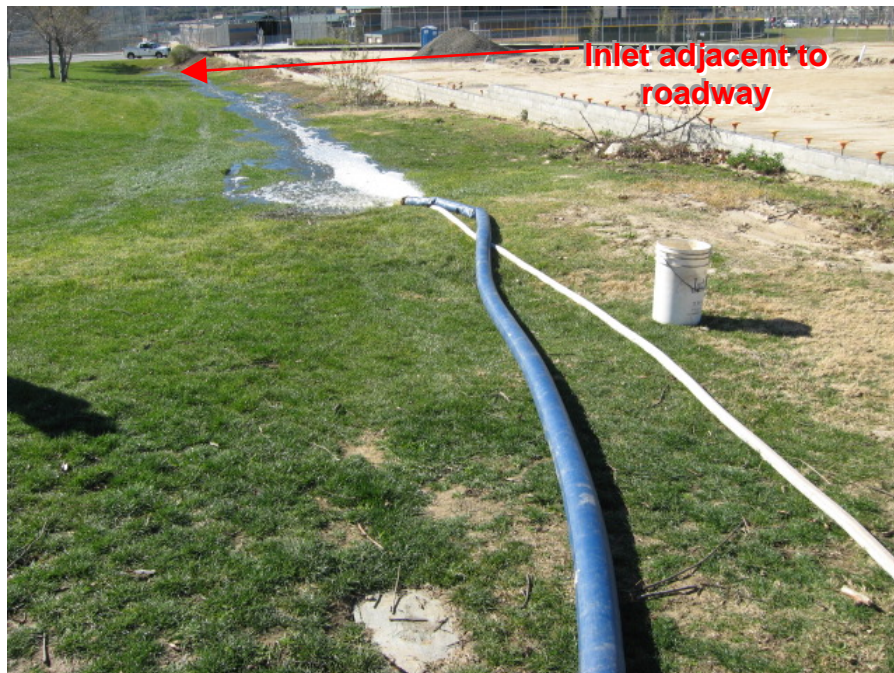
Photograph 14: Non-potable reclaimed water was pumped to a grass drainage swale and subsequent storm drain inlet leading to the Pechanga Parkway Drainage Channel