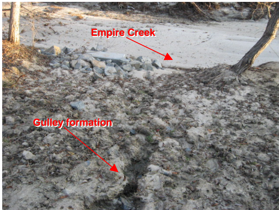
Photograph 4: Erosion beyond the undercut section of silt fence BMP shown in Photograph 3