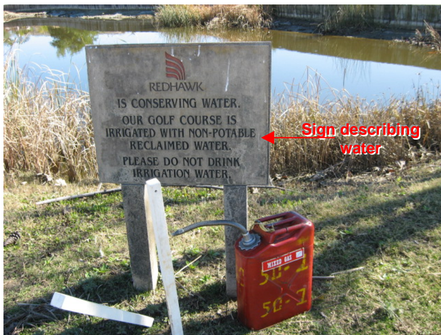
Photograph 12: The water drained from the golf course irrigation pond was from a non-potable reclaimed water source