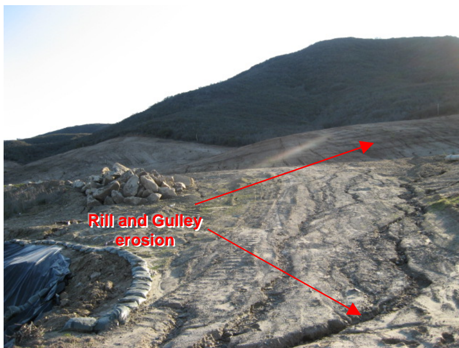
Photograph 6: Rill and gulley formations on the disturbed slope leading to the sediment trap BMP