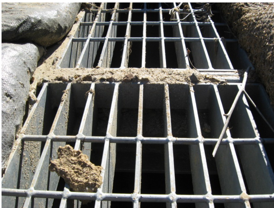
Photograph 11: Evidence of a previous failure event was observed, including sediment that had been discharged to a down-gradient storm drain inlet