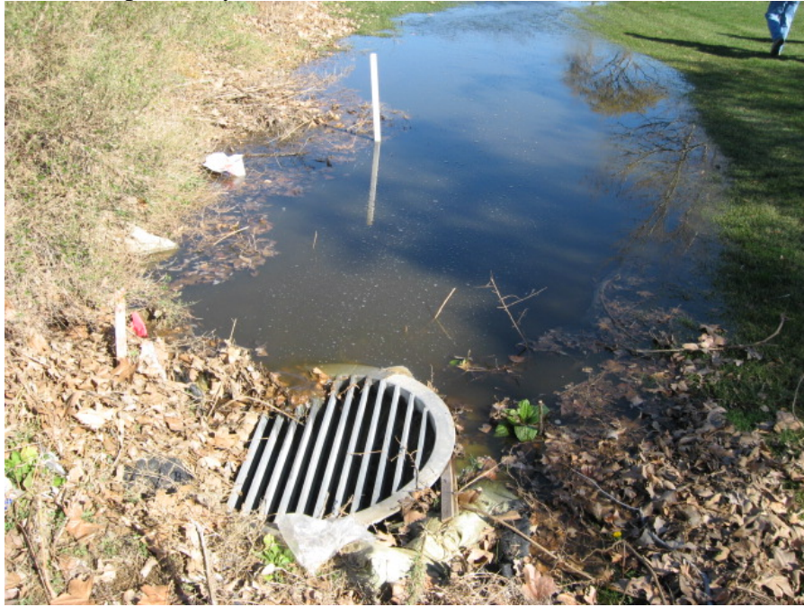
Photograph 15: View of discolored discharge to a down-gradient storm drain inlet

Inspected by: Scott Coulson (PG Environmental, LLC)