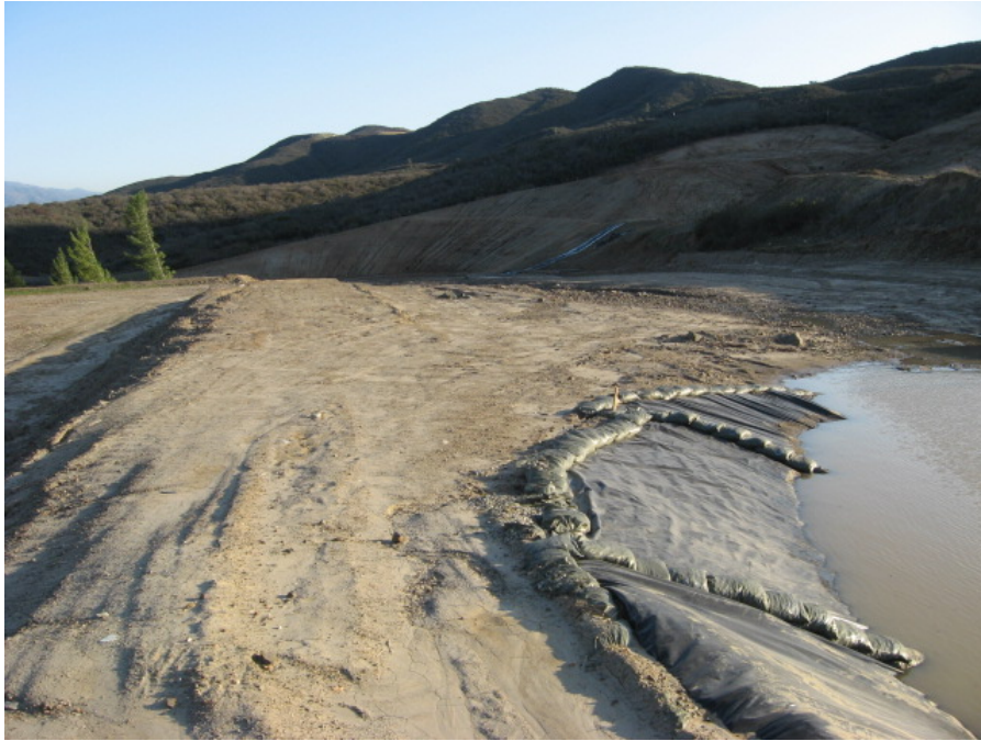
Photograph 7: A large area of exposed soil was observed down-gradient of the sediment trap BMP

Inspected by: Scott Coulson (PG Environmental, LLC)