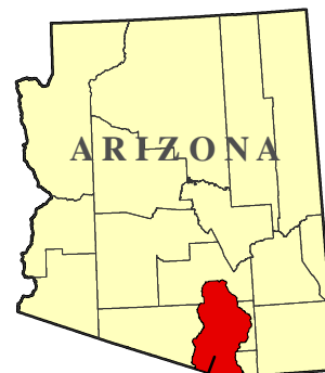
Upper Santa Cruz & Avra Basin

Please note that this working map is a computer representation compiled by the Environmental Protection Agency (EPA) from sources which have supplied data or information that may not have been verified by the EPA. This data is offered here as a general representation only, and is not to be used for commercial purposes without verification by an independent professional qualified to verify such data or information. The EPA does not guarantee the accuracy, completeness, or timeliness of the information shown, and shall not be liable for any loss or injury resulting from reliance upon the information shown.