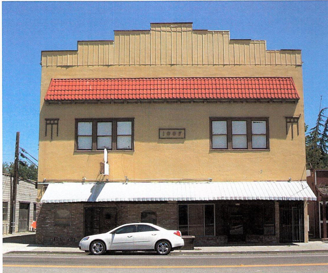
Lindbergh Building, Downtown Esparto