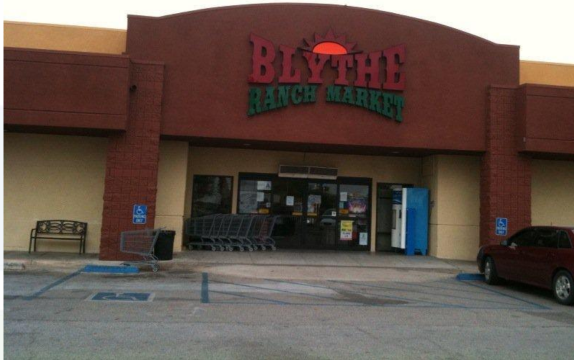
Blythe Ranch Market