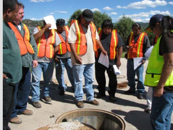
White Mountain Apache Tribe