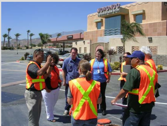
Morongo Band of Mission Indians