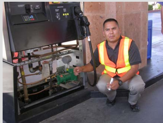
(Other Tribes: Standing Rock Sioux Tribe, Washoe Tribe, and Fort Peck...)