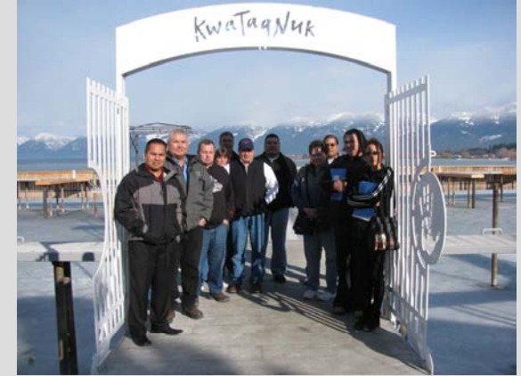
Confederated Salish and Kootenai Tribes