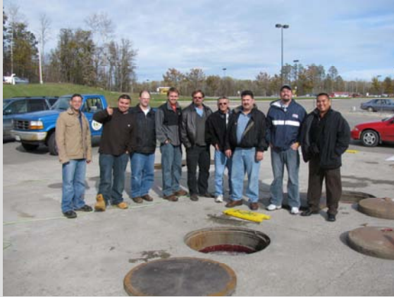
Leech Lake Band of Ojibwe