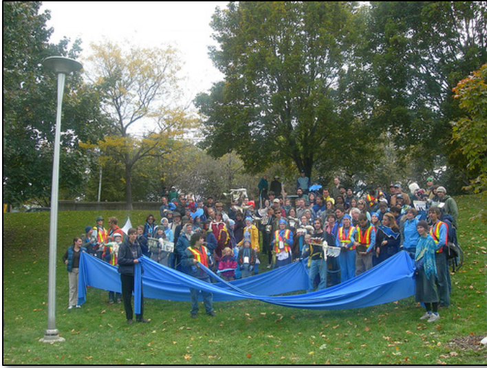
Human River: Walk along underground Garrison Creek, Toronto