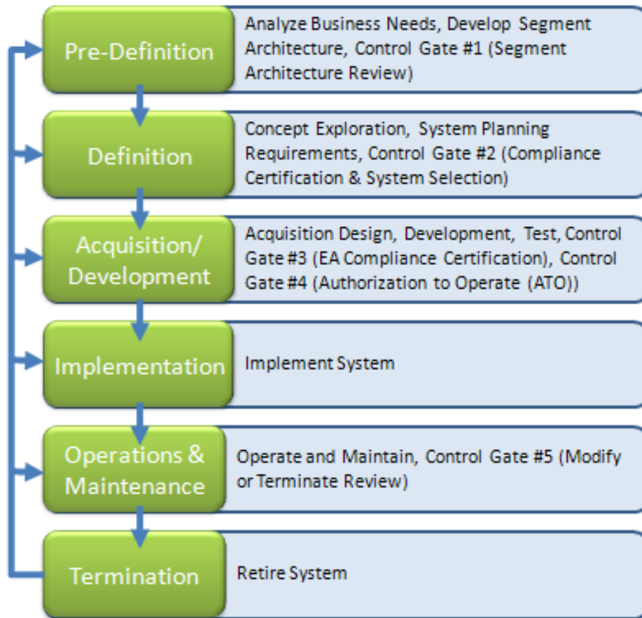
Figure 1 EPA System Life Cycle Management Framework