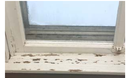
Signs of deteriorating lead-based paint on a windowsill.

More Information: www.epa.gov/lead or contact the National Lead Information Center at 1-800-424-LEAD (TDD: 1-800-526-5456).