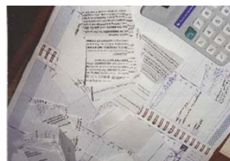
Forged lead disclosure forms.