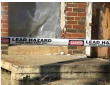
"Danger: Lead Hazard" tape stretched across a work area.