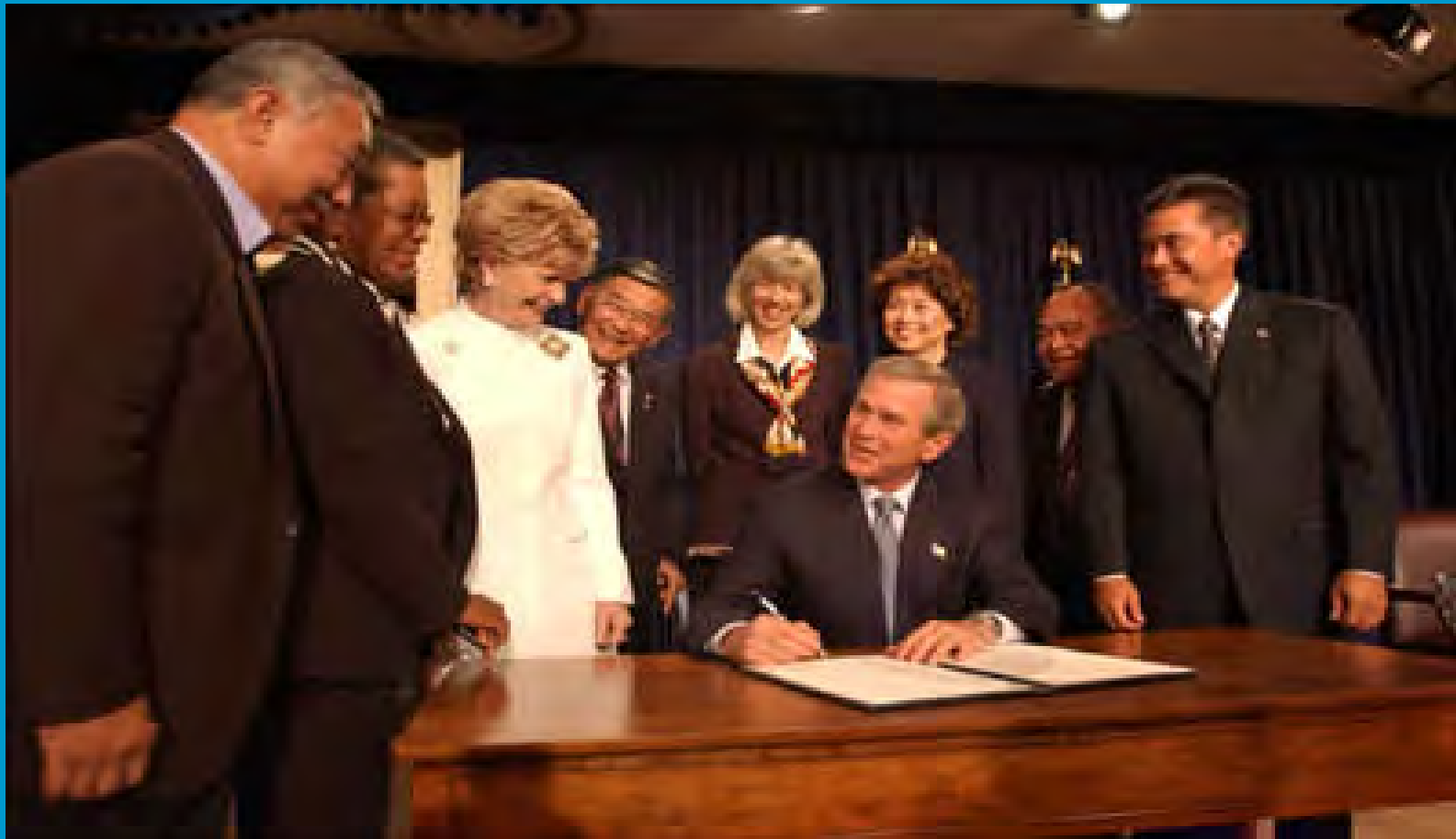
Saipan Environmental Conference