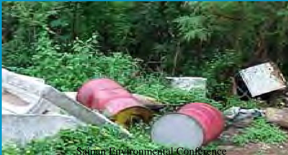
Saipan Environmental Conference