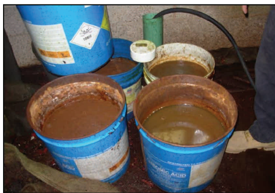
Accumulated wastewater at Smith Chrome Plating that was being discharged to the sewer from the hose shown above