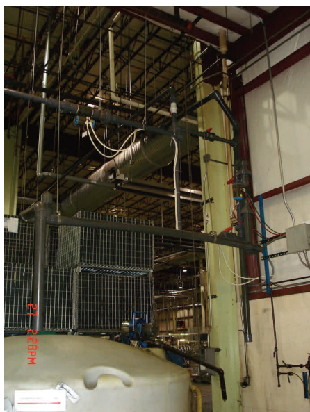
Bypass piping at CYT