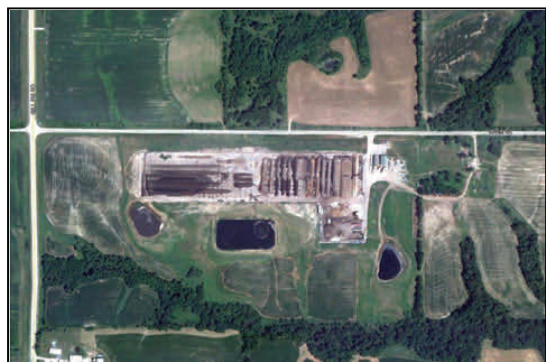
CTI - Eddyville facility

Iowa Company Pleads Guilty to Negligent Pollutant Discharge into U.S. Waters -- On October 26, 2012, CHAMNESS TECHNOLOGY, INC. , plead guilty in federal district court for the Southern District