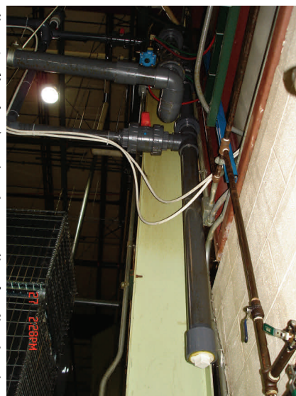
Cut illicit discharge pipe