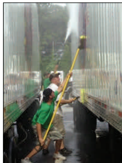
Employees of PMC washing a commercial vehicle