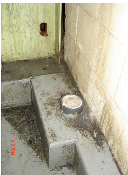
Cut illicit discharge pipe entering the floor drain