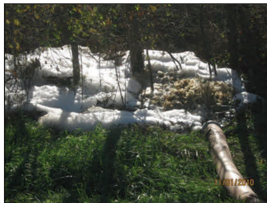
Irrigation hose discharging leachate wastewater