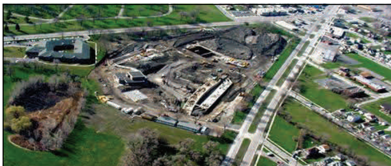
"Baby Creek" combined sewer overflow structure which was required to be re-constructed pursuant to the NPDES permit and the federal consent decree with EPA