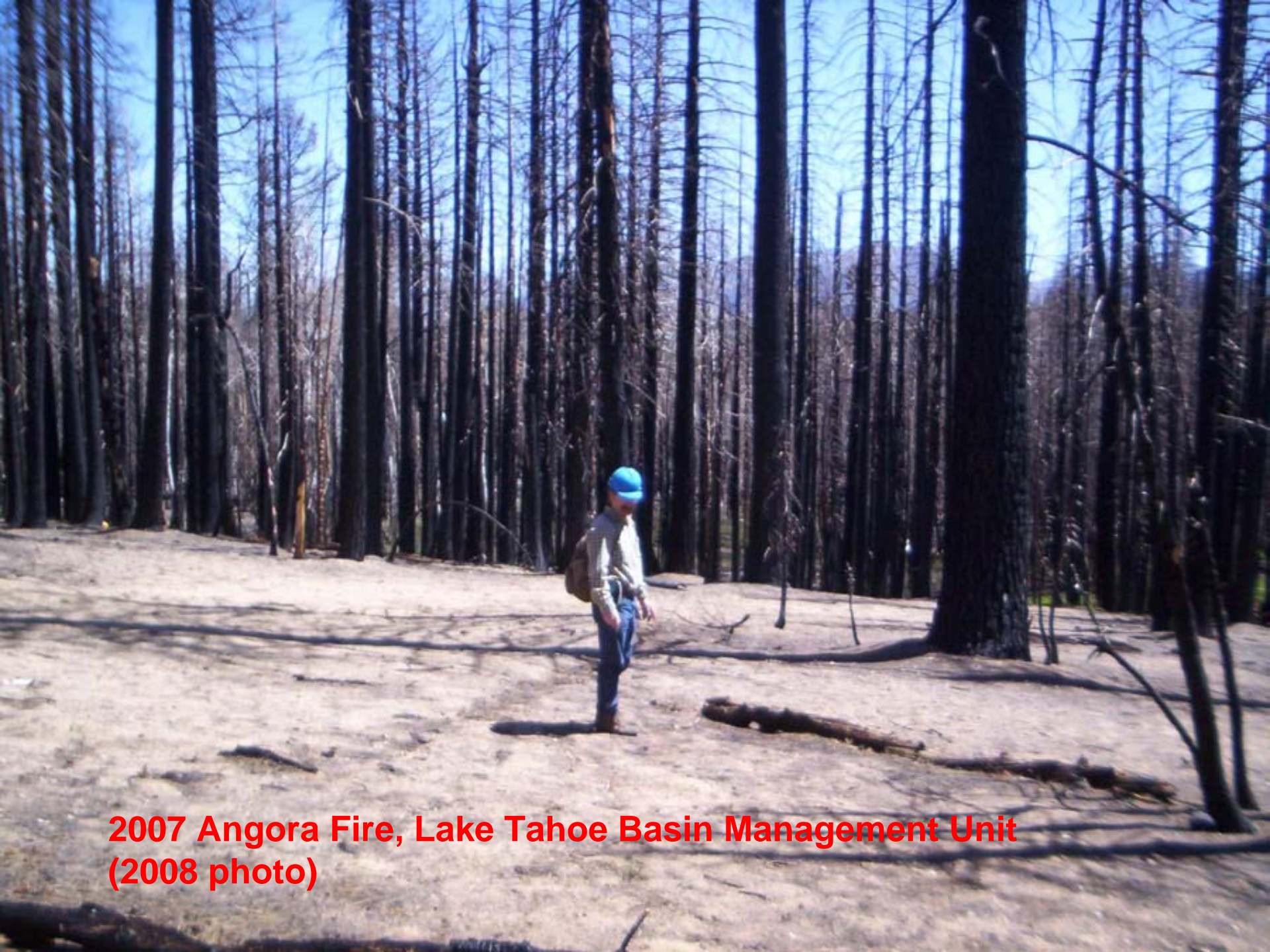
2007 Angora Fire, Lake Tahoe Basin Management Unit (2008 photo)