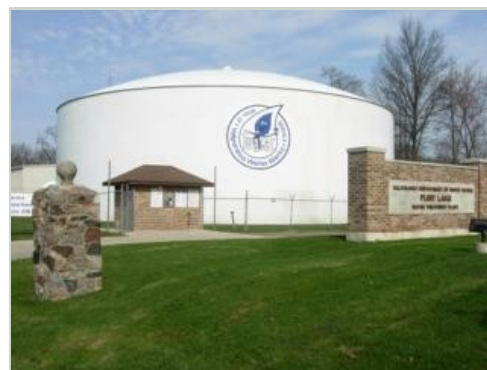
Storage, Flint Lake Drinking Water Plant