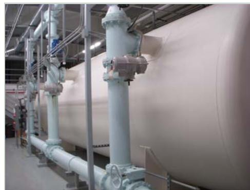
High Pressure Filtration, Flint Lake Drinking Water Plant