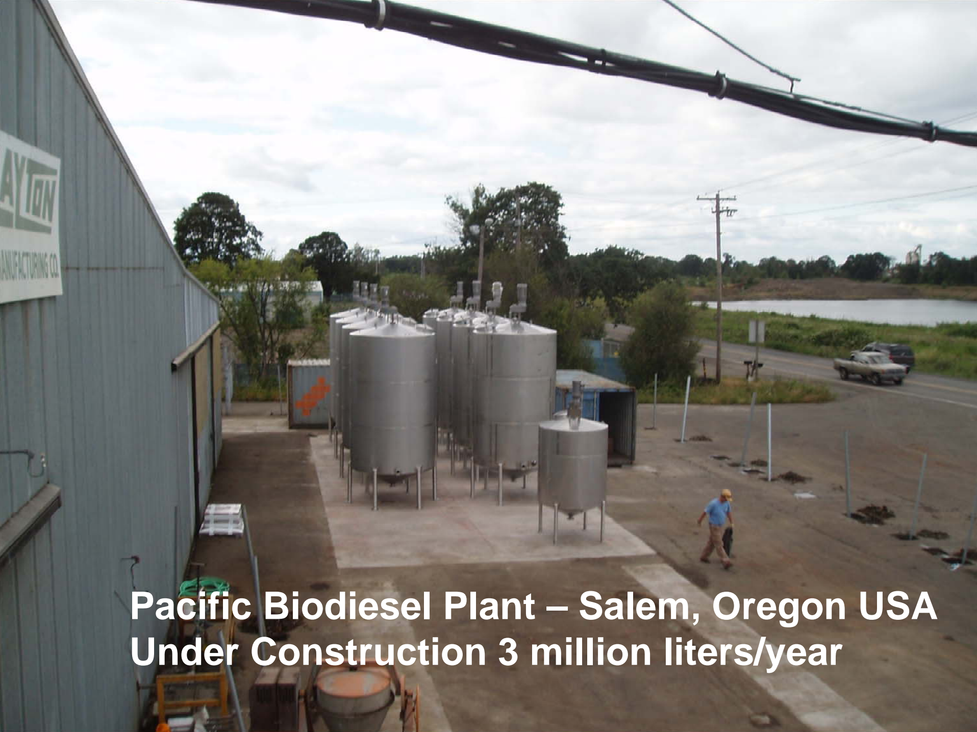
Pacific Biodiesel Plant – Salem, Oregon USA Under Construction 3 million liters/year