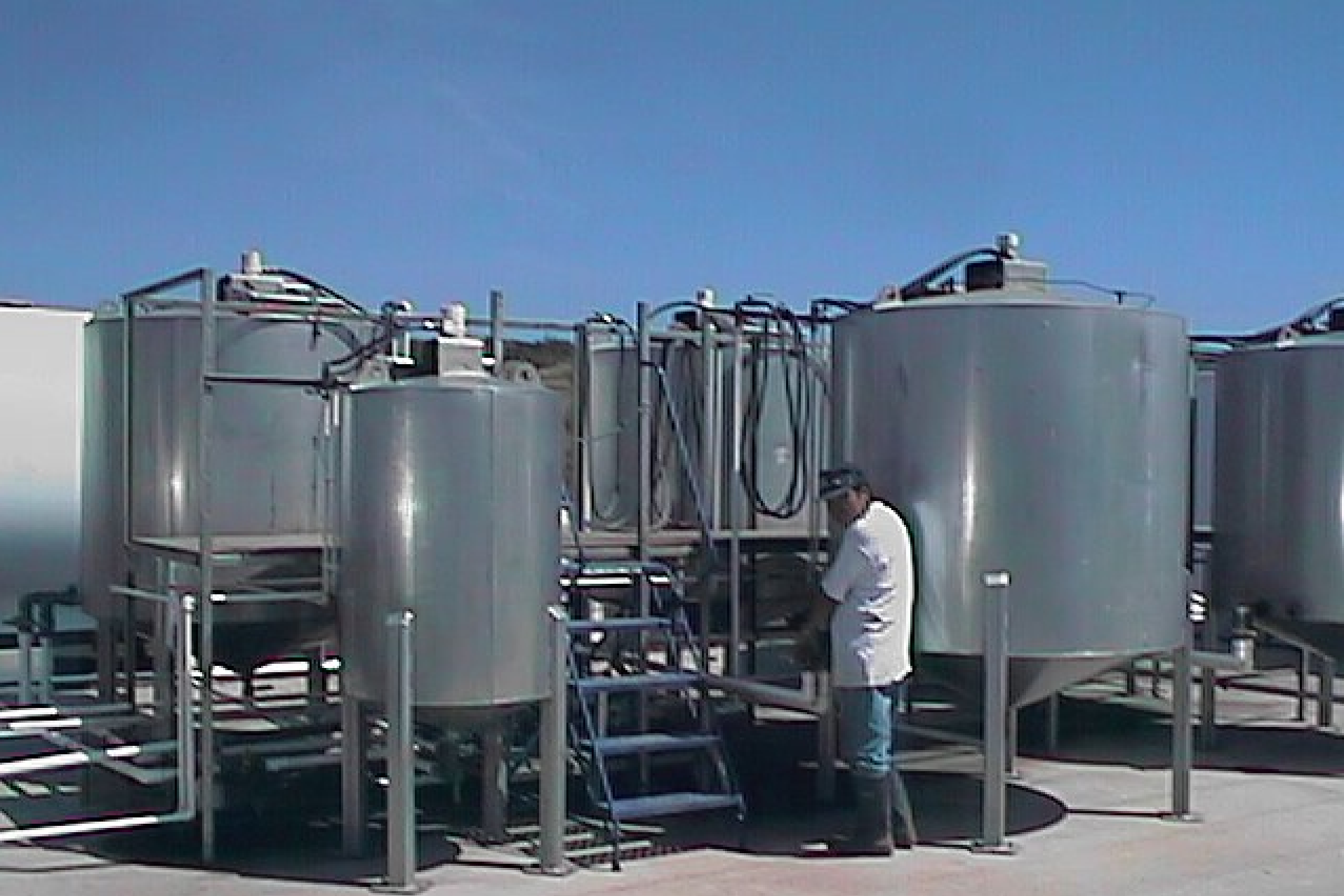
Pacific Biodiesel – Maui, Hawaii USA