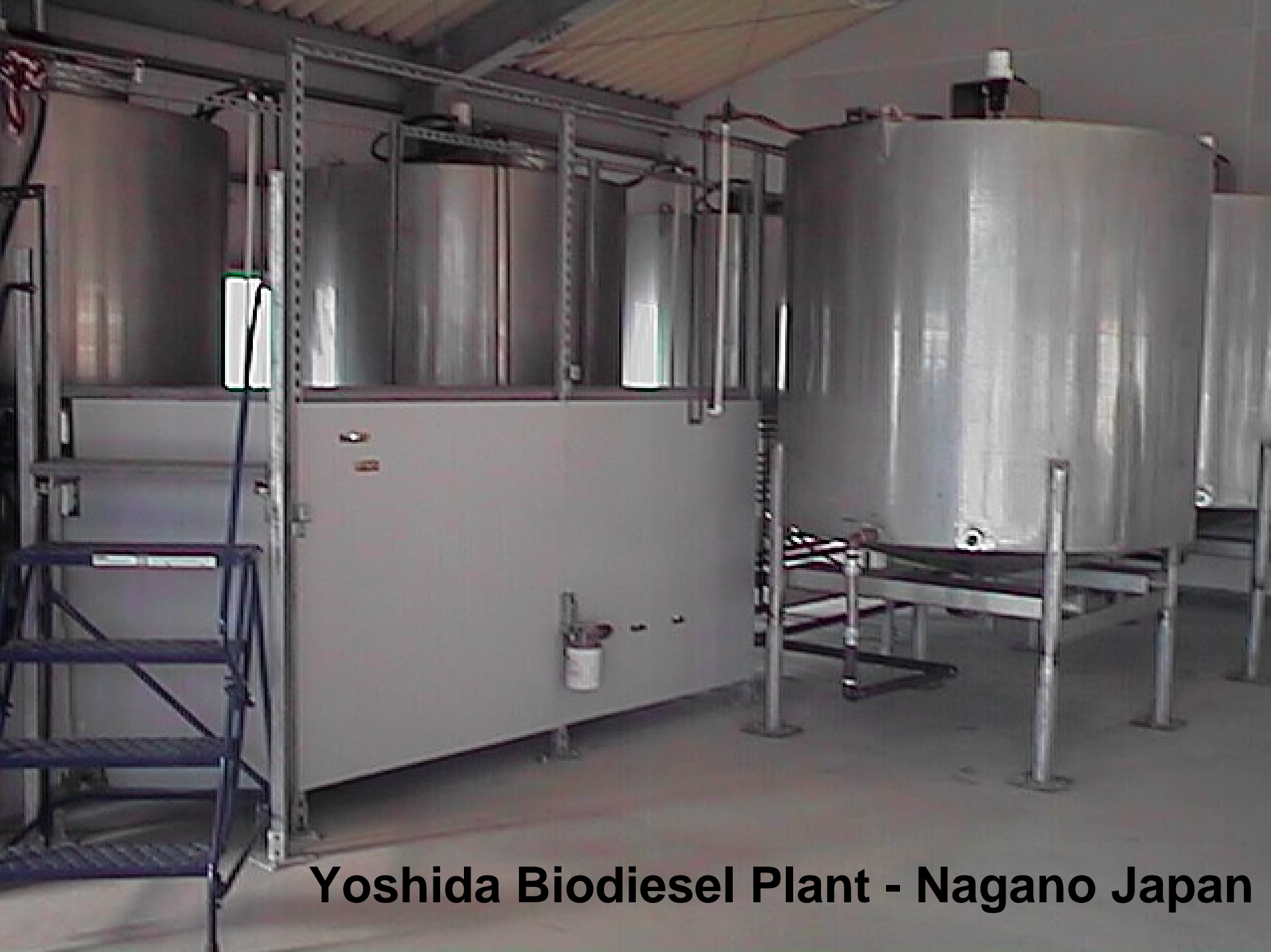
Yoshida Biodiesel Plant - Nagano Japan