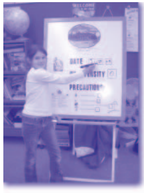
A SunWise student reports the UV Index.

For more information on the Sun Protection Foundation, please visit www.sunprotectionfoundation.org/ .