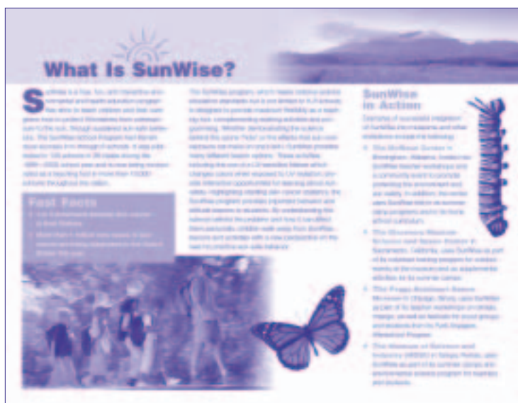
Above and above right: EPA's new brochure promoting the learning institutions initiative.

Through programs such as summer camps, planetarium shows, children's theater, and special events, kids can learn about the importance of sun safe behaviors, with an emphasis on science. Adults involved with after-school clubs, health fairs, teacher training workshops, nature centers, and community events can also integrate SunWise into their educational programs.