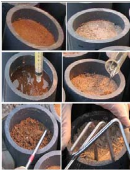
AZ (left) and NV (right) soil columns before and after product application.

The use of dust suppressants not only enhances dust control but can also significantly reduce the amount of water needed to effectively control dust. However, application of dust suppressants could also negatively impact the quality of underground water and surface water bodies through infiltration or storm water runoff.