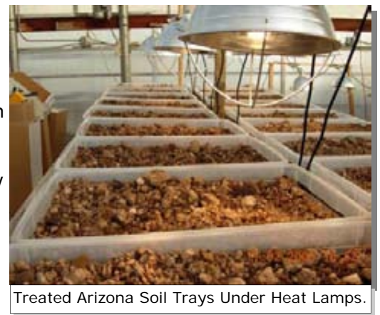
Treated Arizona Soil Trays Under Heat Lamps.

soil plots treated with six dust suppressant products was evaluated for water quality and aquatic toxicity. The study also evaluated the quality of water leached through soils treated with dust suppressant products. The study design replicated, to the extent possible, conditions under which dust suppressants are typically applied at construction sites in desert climates.