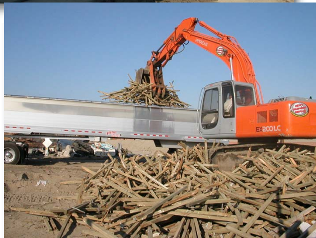
Auclair dump site during cleanup.