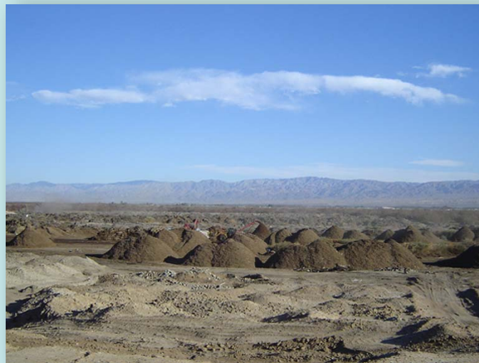
Ibanez dump site cleanup.