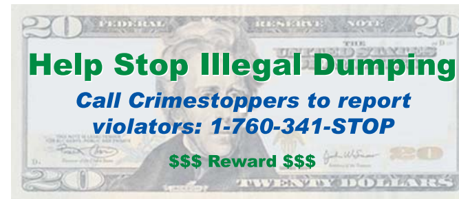
Handout distributed by the Outreach Taskforce at the 2007 Riverside County Fair and Date Festival.

The Coachella Valley was hit hard by the cold spell this past winter. To stay warm some residents burned grape stakes treated with chromated copper arsenate (CCA), which look similar to firewood. However, when burned or cut, CCA-treated wood becomes extremely hazardous and can cause nausea, sore throat, dizziness and headaches. Further, arsenic is also a known carcinogen. Members of the collaborative including the South Coast Air Quality Management District, Department of Toxic Substances Control, Agency for Toxic Substances and Disease Registry, the Torres Martinez Tribe and EPA mobilized quickly to produce Spanish and English public service announcements and fact sheets, and met with growers to inform them of best practices for managing CCA-treated grape stakes.