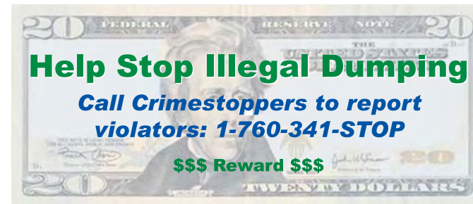
Handout distributed by the Outreach Taskforce at the 2007 Riverside County Fair and Date Festival.

The Coachella Valley was hit hard by the cold spell this past winter. To stay warm some residents burned grape stakes treated with chromated copper arsenate (CCA), which look similar to firewood. However, when burned or cut, CCA-treated wood becomes extremely hazardous and can cause nausea, sore throat, dizziness and headaches. Further, arsenic is also a known carcinogen. Members of the collaborative including the South Coast Air Quality Management District, Department of Toxic Substance Control, Agency for Toxic Substances and Disease Registry, the Torres Martinez Tribe and EPA mobilized quickly to produce Spanish and English public service announcements and fact sheets, and met with growers to inform them of best practices for managing CCA-treated grape stakes.