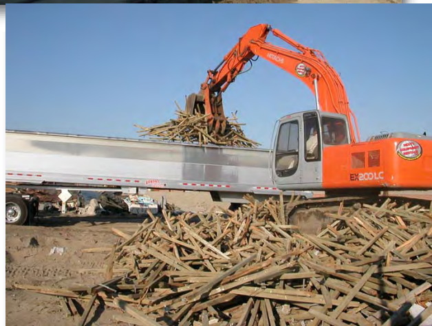
Auclair dump site during cleanup.