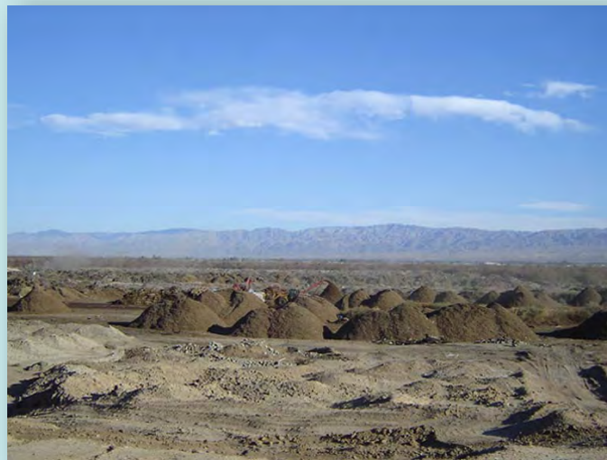
Ibanez dump site cleanup.