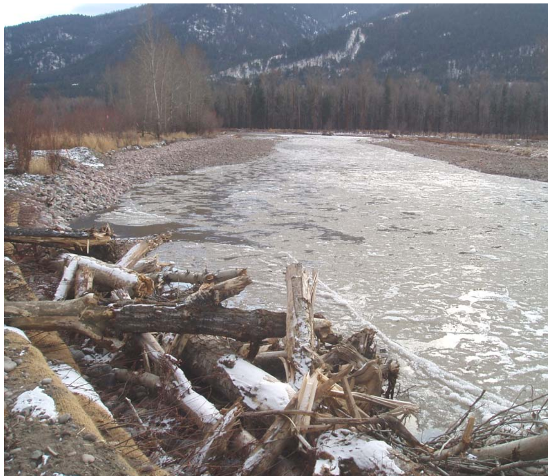
December 2009: Newly finished upstream channel of the Clark Fork River channel.

2011 Remediation Restoration Redevelopment