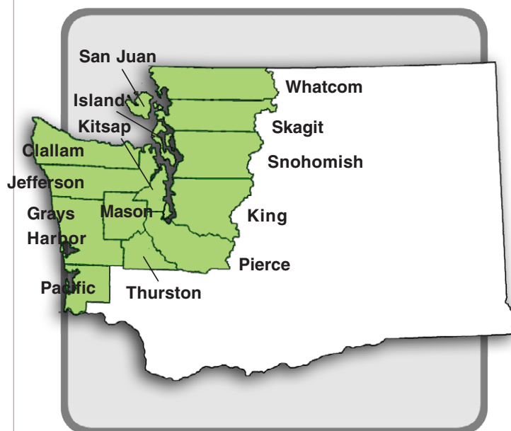
Table 1. Breakdown of monitored and unmonitored coastal beaches by county for 2008.